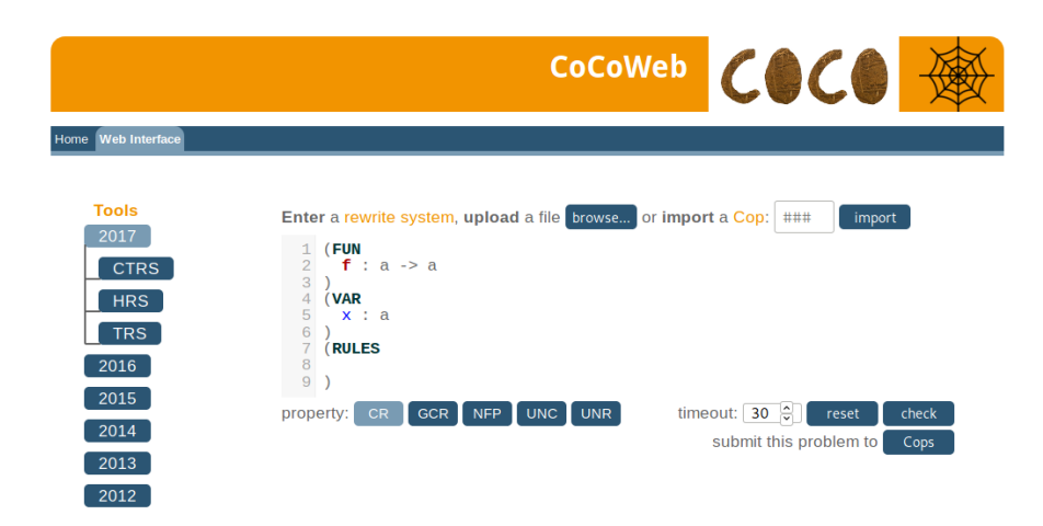
Fig. 2. The entry page of CoCoWeb.